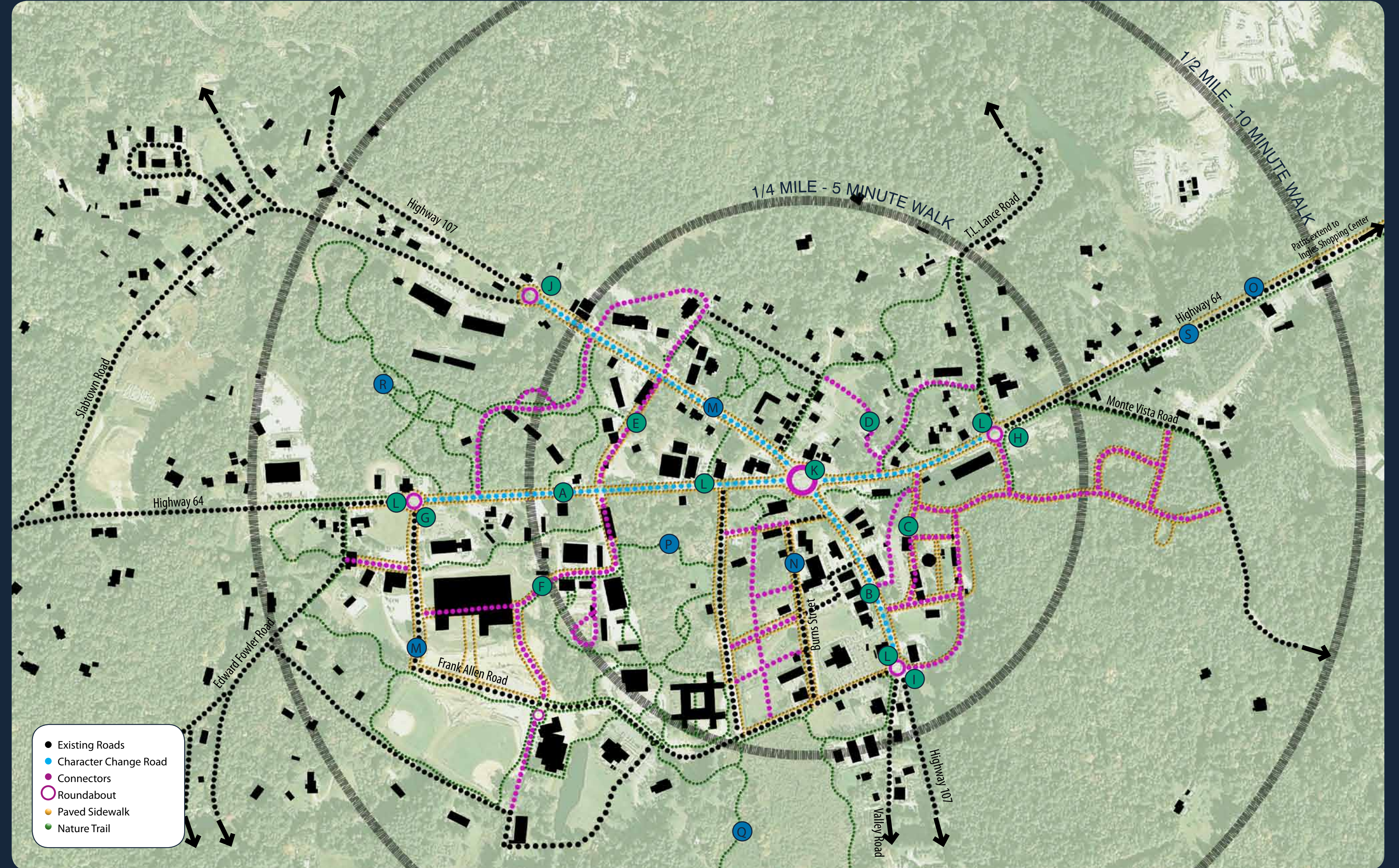
TRANSPORTATION CONCEPT PLAN ILLUSTRATING SIDEWALKS, TRAILS, AND NEW ROAD CONNECTIONS