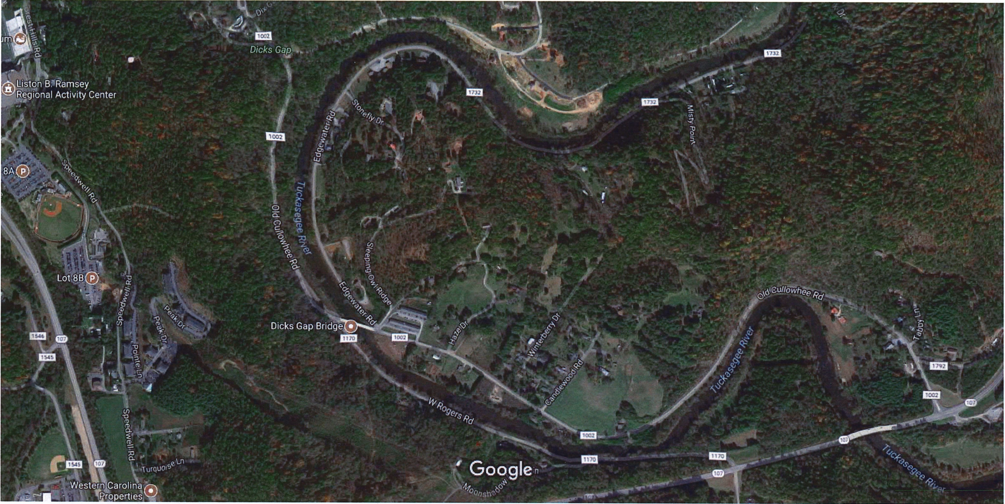
Imagery ©2017 Google, Map data ©2017 Google United States 500 ft