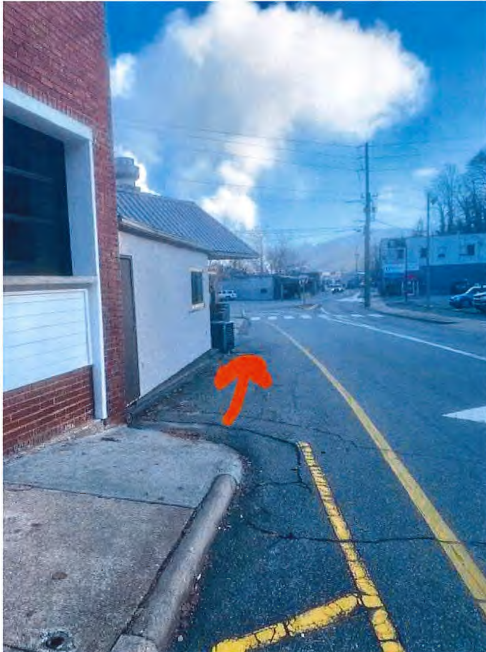
Proposed Sidewalk Location – North Side of Main Street to the Crosswalk at the Intersection of Main Street and Mill Street