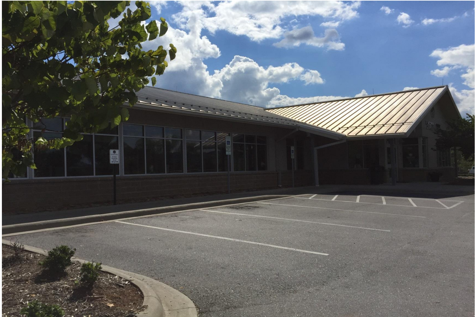
Buncombe County Animal Shelter