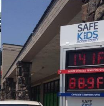
Car seat checks planned for national safety week