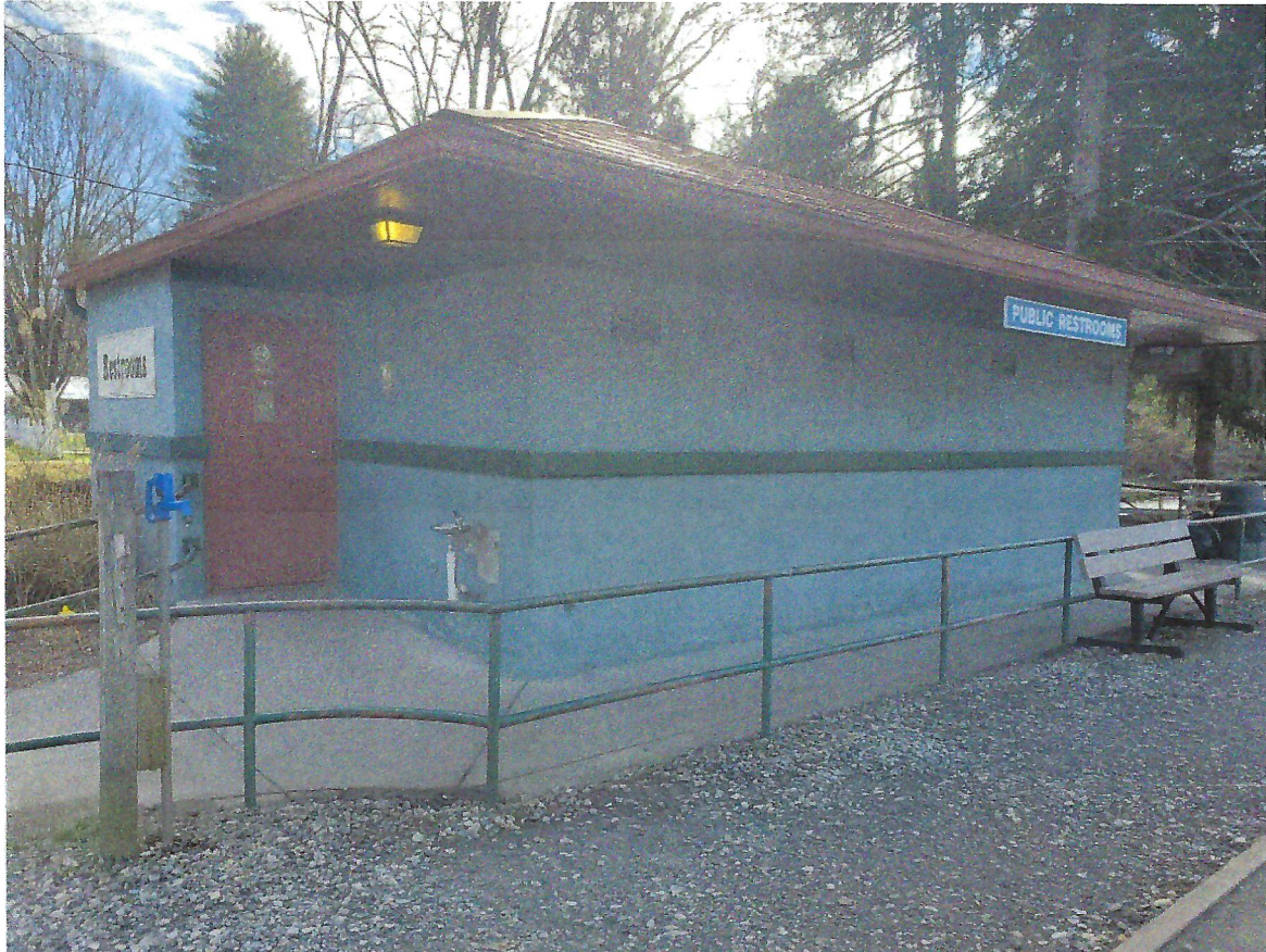
Exterior pictures of building prior to project.