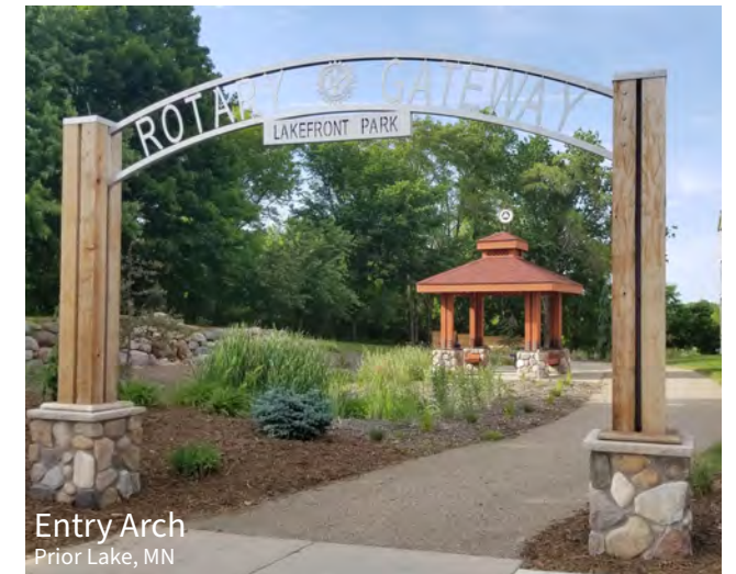
Entry Arch Prior Lake, MN