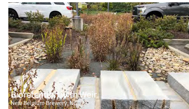
Bioretention with Weir New Belgium Brewery, NC