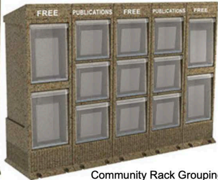
Community Rack Grouping