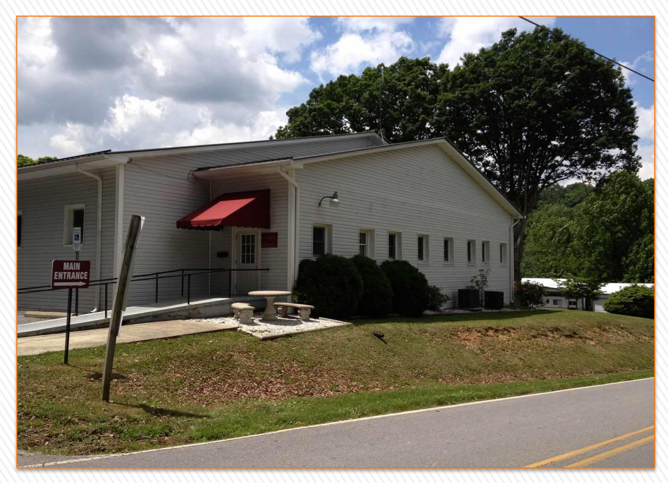
You can make anything look good.